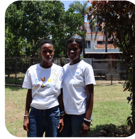
ABORTION & THE LAW TRAINING